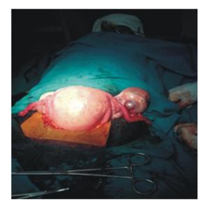
Fig. 1: Intraop findings showing solid to cystic mass arising from left ovary.

T3-1.07ng/ml T4-6.05µg/dl TSH-2.95µIU/ml